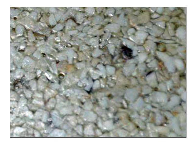
Figure 4. Proximity to the surface of a product cast in a plastic mould