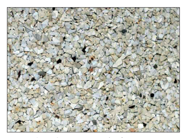
Figure 2. Aggregate grains from waste electrical insulators subjected to sieving through screens of 1 and 2 mm mesh size

The condition for obtaining a composite material which is both decorative and characterized by high strength parameters required the use of a suitable binder. It was considered that the material should be a transparent resin, which remains transparent after curing and has high strength parameters. This goal was dictated by the desire to prepare a permanent composite, in which ceramic aggregate filling will be exposed. Taking into account the above factors, a colorless, transparent unsaturated Crystal Clear Synolite 1881 polyester resin made by Scott Bader Finland was used. The basic parameters of the resin from its technological chart are presented in Table 1.