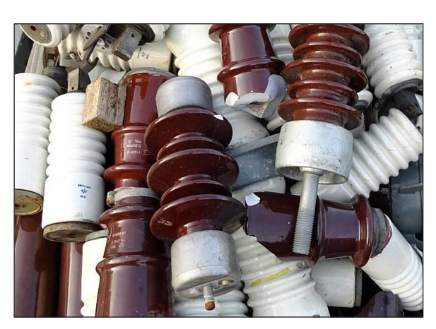
Figure 1. Disused electrical insulators in a landfill

The basic raw material for the production of the synthetic composite involved the electric insulators obtained by an electrical company during the renovation works of overhead electrical lines. The waste obtained in this way was transported in containers to a landfill (Fig. 1). Afterwards, the waste in the presented form was transported to the laboratory, initially crushed