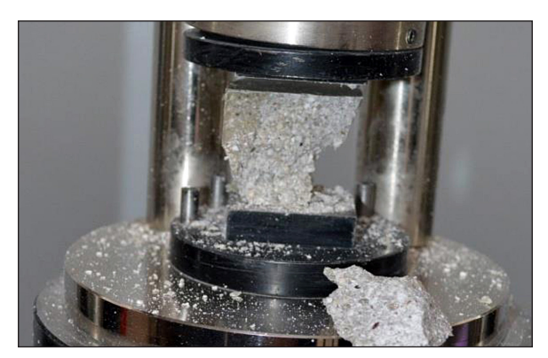
Figure 5. Composite sample during the compression strength test

the strip composite could cause that most of the stress was carried by the resin. Well-chosen proportions of fine and coarse (recycling) filler and its form of angular grains could cause the aggregate to form a tight load-bearing framework. The task of the binder was only in this case to bond the grains of this aggregate skeleton.